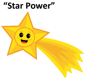
by the Greenfield-Central School Foundation

The Greenfield-Central School Foundation's new STAR Power program is the perfect way to thank your child's teacher, principal, coach, librarian, social worker, instructional or health assistant, secretary, bus driver, custodian or cafeteria worker. STAR Power provides parents and community members an opportunity to honor extraordinary teachers and staff for the difference they make (or made) in their child's school experience. At the same time, with a minimum gift of $10.00 to the STAR Power Fund, you help support education. Each honoree will receive a personalized card listing the donor's name and any special sentiment you wish to include. All proceeds benefit the GCSF Educational Enrichment (E2) Grants which provide teacher, classroom and student resources. To find a STAR Power submission form, go to <a href="https://www.gcschoolfoundation.org">www.gcschoolfoundation.org</a> under the "Say Thanks" tab.